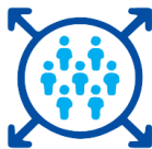
Funding Capacity Building needs

The GROW Fund is an initiative by EdelGive Foundation with the aim to raise USD 13 million towards building, supporting, and sustaining 100 grassroots organisations across India, over a period of 24 months. In the context of the challenges posed to these organisations by the existing pandemic, the Fund will be used to create sustainable and resilient organisations by: