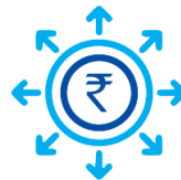
Funding Core Costs and Important Functions